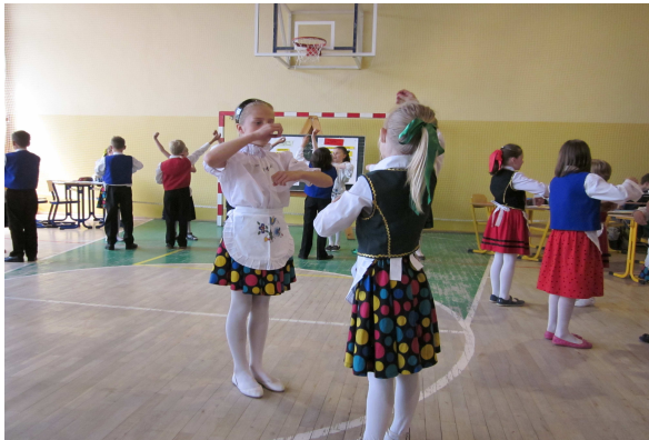
School children performing Kashubian dances