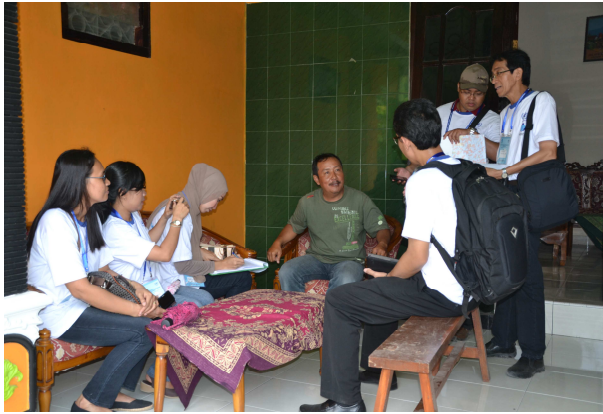
Figure 1: Fieldwork participants interviewing the chief of Desa Kliwong