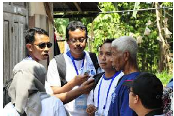
Figure 2: Fieldwork participants interviewing local inhabitants

Optimal teaching conditions, with coffee, tea and lunches provided on site (so that participants need not leave the premises) made it possible, also thanks to the extremely motivated audience, to have an exacting 9-6 lecturing program.