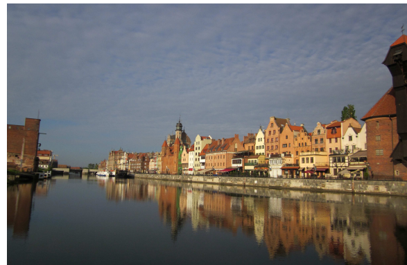
The historical port at the Motława River