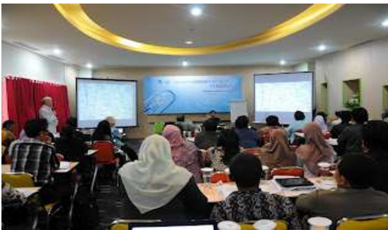
Figure 3 – classroom circumstances

The second part of the fieldwork took place in two nearby archeological complexes, the Ratu Boko 8 th century extensive acropolis overlooking the Prambanan plain, and the 9 th century Banyunibo Buddhist temple close by, stressing the role of geographical names standardization as a means of preserving the cultural heritage.